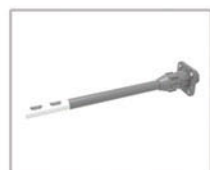
Wind Speed Sensor