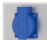
European Standard Socket