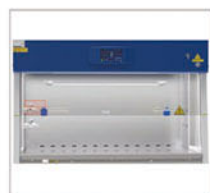
Work Zone Work zone, made of 304 stainless steel, is surrounded by negative pressure.