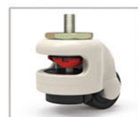
Footmaster Caster Universal caster with brake and leveling feet.