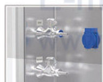
SS Water tap & Gas tap