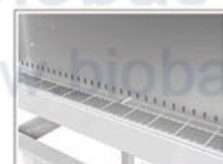
Anti-paper dust structure