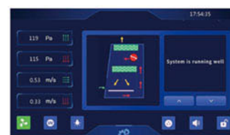
Color Touch Screen Touch operation, real-time and clearer display of various values and appointment timing function.